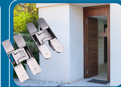
HGS3D-S160SH 3-WAY ADJUSTABLE CONCEALED HINGE