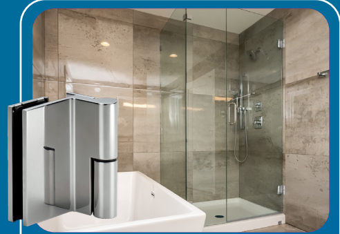
GH-G02SH GLASS DOOR GRAVITY HINGE