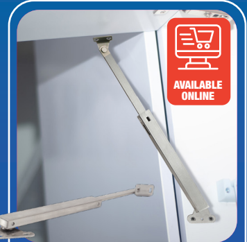
L SERIES LID STAY