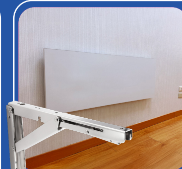
EB BRACKETS FOLDING BRACKET