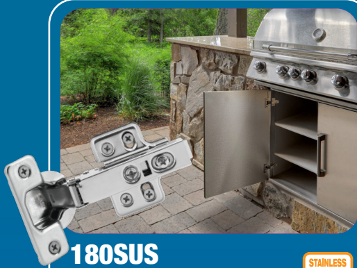
180SUS SOFT-CLOSING EURO CUP HINGE