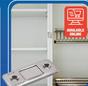
MC-159-SUS MAGNETIC CATCH