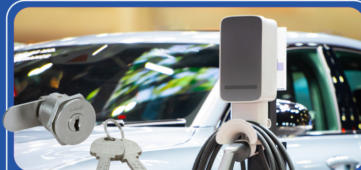
3800S SHEET METAL CAM LOCK